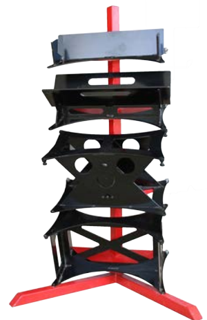
Top Attachments TED-ACC-006-00