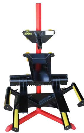
Front Attachments TED-ACC-005-00

Minimise trip hazards by keeping your attachments out of the way with our upright attachment stands. Stands include pins and or nuts and bolts necessary to hold attachments in place securely. both stands have a capacity of 4 attachments.